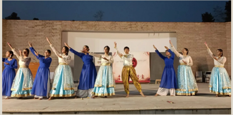
Students of Uncage Academy with their Kathak performance