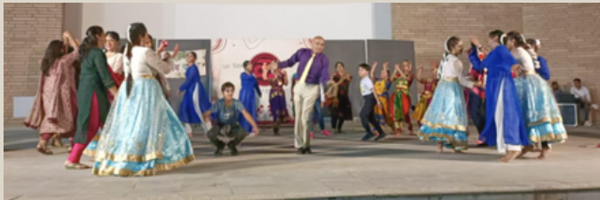
Our audience on their feet to the beats of dandiya music!