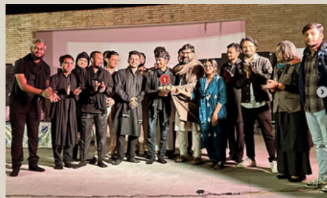
Kathakaarmandali's performance truly weaved magic in the open sky with their theatrics that left the audience truly awestruck. Another successful Chai Chaupal