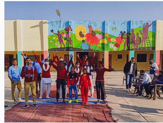
The walls of the schools were painted and given an artistic makeover by Dulux.

The concert was well received by our audience and followers with over 600 people tuning in to attend the concert.